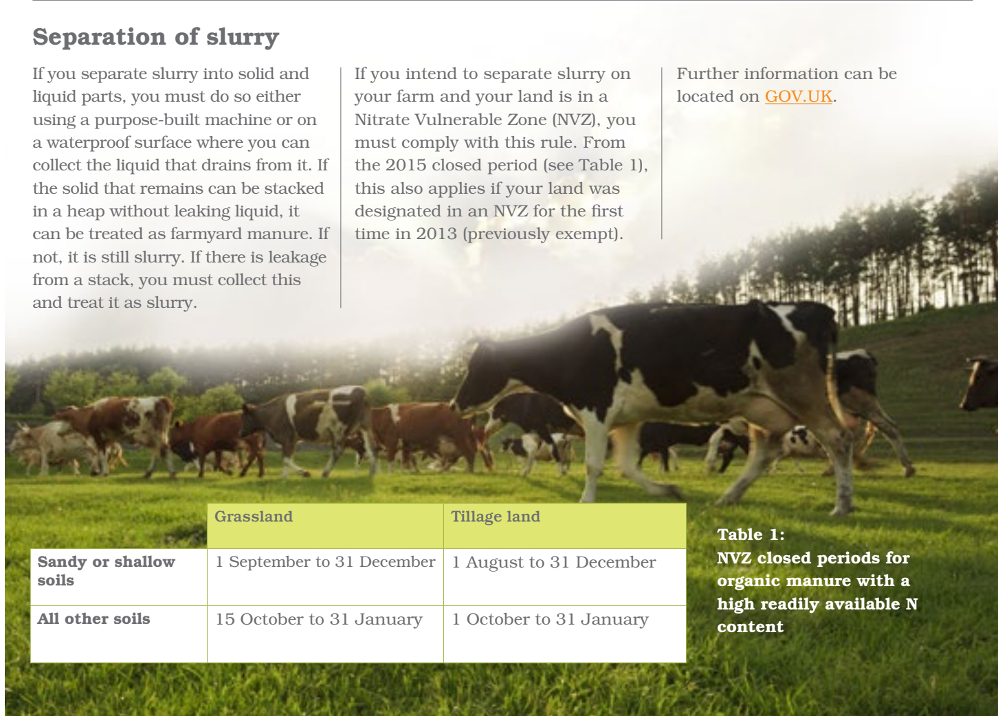
Table 1: NVZ closed periods for organic manure with a high readily available N content